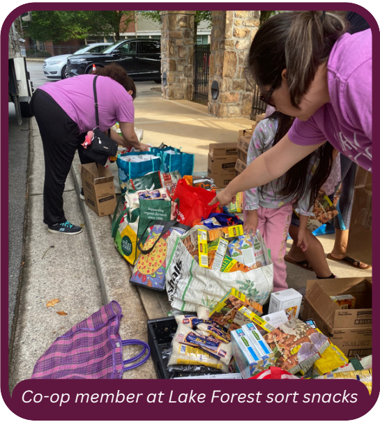
Co-op member at Lake Forest sort snacks