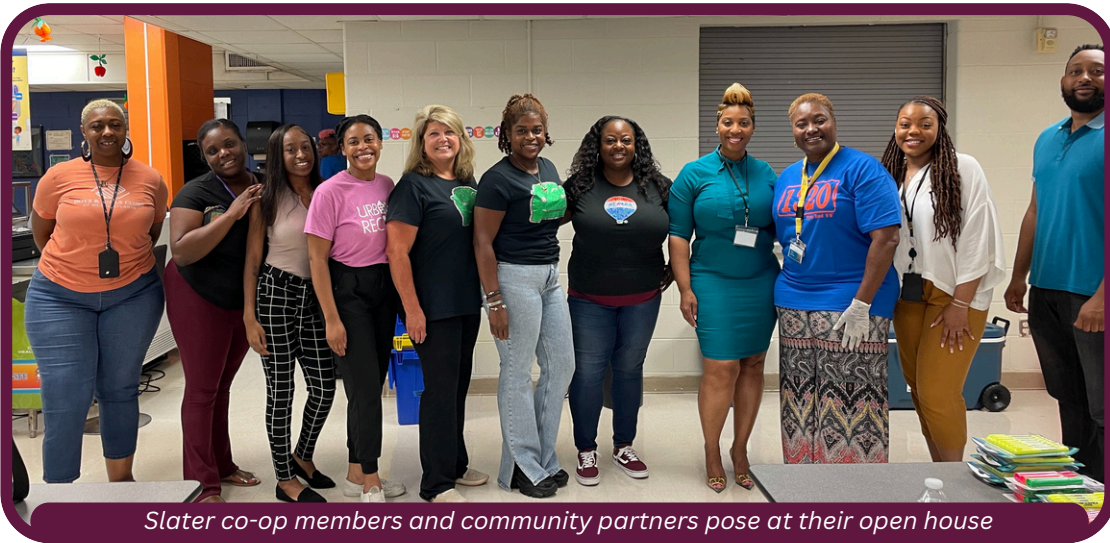
Slater co-op members and community partners pose at their open house

These three co-ops are hosted at schools and are entirely comprised of faculty, staff, and students' families. These co-ops are rooted in and grow within the school community, and it is such a gift to see the community sharing another aspect of their lives through co-op.