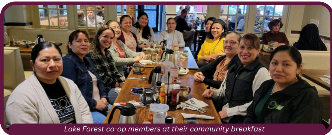
Lake Forest co-op members at their community breakfast