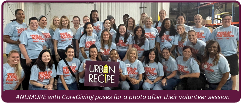
ANDMORE with CoreGiving poses for a photo after their volunteer session

CoreGiving is a steadfast supporter of Urban Recipe. An organization dedicated to eliminating child hunger through partnerships with hunger-relief organizations, their support comes from the Blackstone Real Estate portfolio companies.