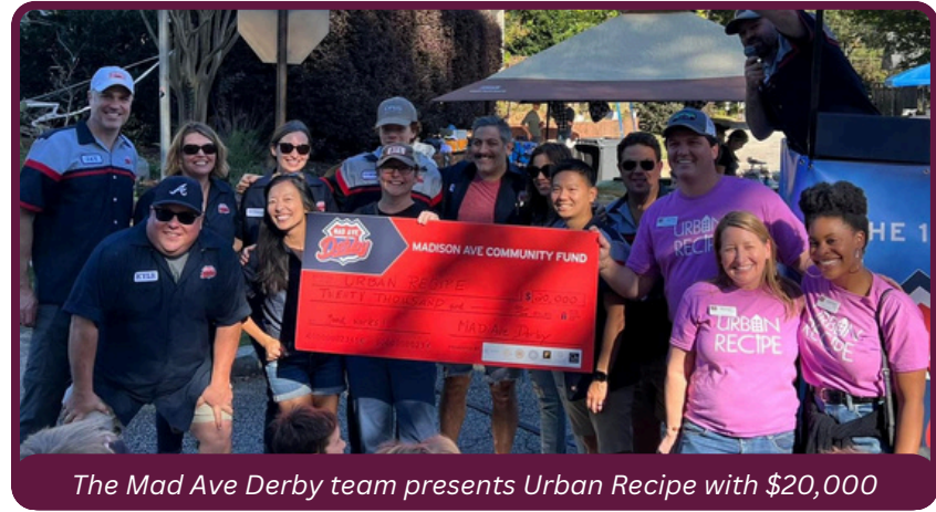
The Mad Ave Derby team presents Urban Recipe with $20,000

We had a blast this past weekend at the Mad Ave Derby and were honored to be this year’s beneficiary!