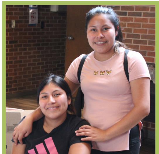
Members of St. Anne's Co-op