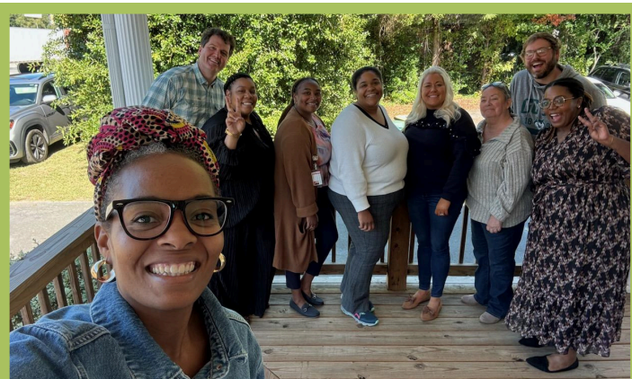
Day One of CPP training

Opening a co-op is an undertaking, but we are so grateful for partners who step up to the plate and make space in their organizations to serve their neighbors.